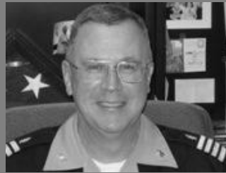
Stanton Cope Mid-Atlantic