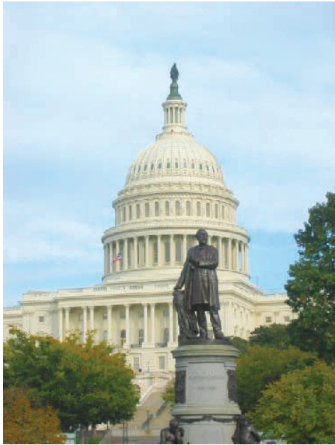
National Capitol Building, Washington DC

The 12th Annual American Mosquito Control Washington Conference was held on May 10-12, 2010. Washington Day has been held annually since 1999. It is the optimal way to learn first-hand about the exciting and creative legislative process. It is vital for AMCA (and GMCA) to maintain a presence on Capitol Hill year after year, so that our mosquito control industry is at the forefront of legislative consideration on important